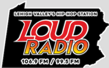
LOUD RADIO 106.9/99.5 LEHIGH VALLEY