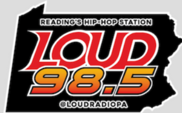
LOUD 98.5 READING